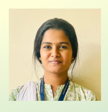
GAUWDAMI P 2228321